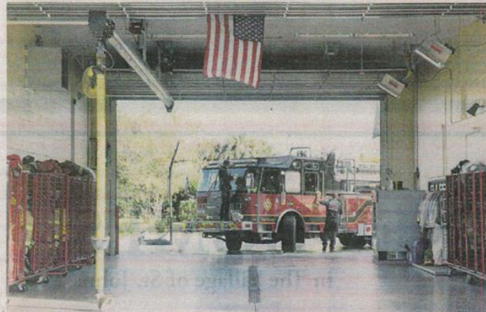
Cindy Sleep | Daily Sun

Creating an independent fire district in The Villages was one of several acts by the Florida Legislature during the session that wrapped up Monday.