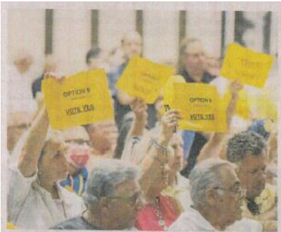
A sea of yellow signs in support of The Villages Public Safety Department materialized throughout the night.