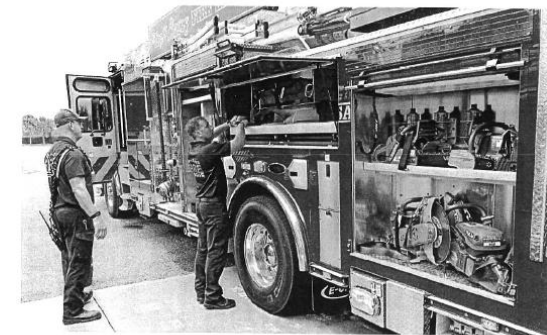
The Florida Senate on Thursday unanimously approved the bill to create an independent fire district in The Villages. If Gov. Ron DeSantis signs the bill as expected, the issue will go before voters in November.